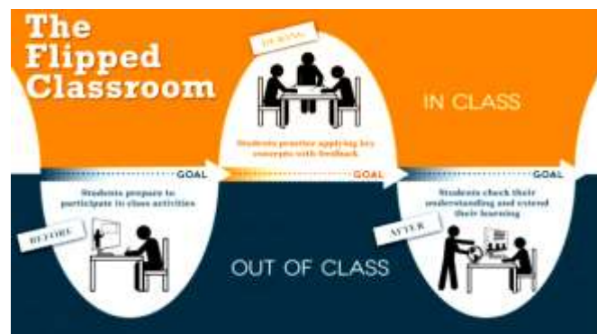
Figure 2. Concept of the flipped classroom learning model (Dong, 2019)

learning (Nugraheni et al., 2022). This material is given before students carry out learning activities in the classroom so that students can study independently at home first. Apart from that, the critical thinking ability test questions are also packaged with ethnosience.