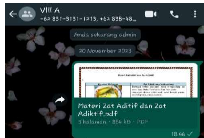
Figure 3. Providing material via whatsapp group

The flipped classroom model learning activity with an ethnosience approach begins by providing material about additives and additive substances packaged in ethnosience via a WhatsApp group.