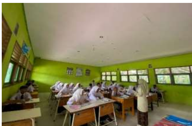
Figure 6. Evaluation by teacher

Then the teacher evaluates the learning that has taken place.