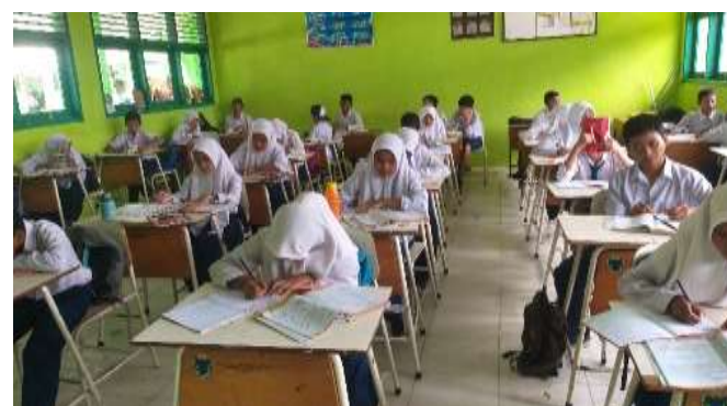
Figure 4. Students note things they don't understand

The next activity is for students to note down things they don't understand to discuss together.