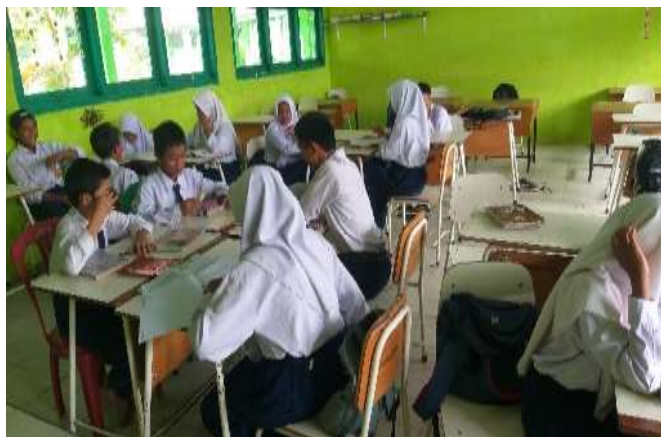
Figure 5. Students discussing

Then students carry out discussion activities to find answers to various things they do not understand. At this stage the teacher acts as a facilitator.