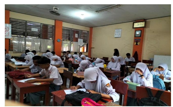
Figure 2. Completion of the learner's practicality questionnaire by a large group