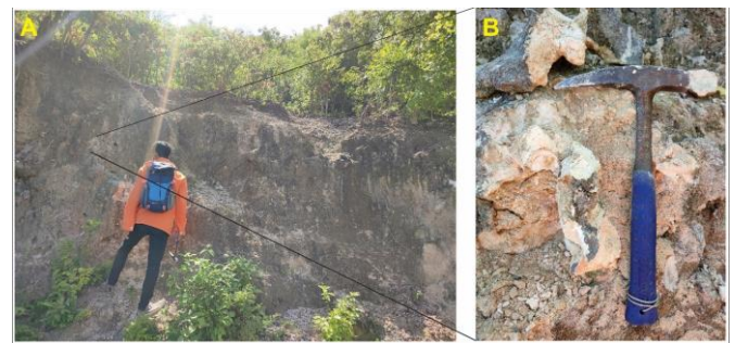
Figure 4. Field geological survey at the research site. (A) Limestone outcrop on hillside and (B) Limestone outcrop at close range.

Petrological analysis of limestone outcrops at Stations A1 and A2 showed white rocks, poorly sorted, open packed, floating grains in the matrix (matrix supported) and massive structure. This limestone has been recrystallized because it is very porous and composed of coral, large foraminifera, micrite and opaque minerals (Figure 4). Based on this description, the limestone facies are the coralline floatstone facies (Embry & Klovan, 1971).