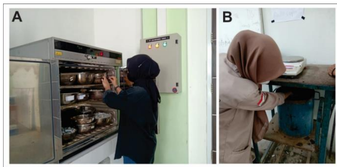
Figure 3. Laboratory analysis of the specific gravity and water absorption of coarse aggregate. (A) Drying the sample using an oven before weighing and (B) Weighing the sample in water.

Laboratory analysis consisted of two analyzes, namely the specific gravity and water absorption tests of coarse aggregate which were carried out at the Soil Mechanics Laboratory, Faculty of Engineering, Universitas Negeri Gorontalo (Figure 3). The equipment used for laboratory analysis of specific gravity and coarse aggregate water absorption tests refers to (BSN, 2008; Gazalie et al, 2022) consisting of six tools. First, a scale with an accuracy of 0.1% and equipped with equipment to hang the test sample container in water in the middle of the scale. Second, the test sample container