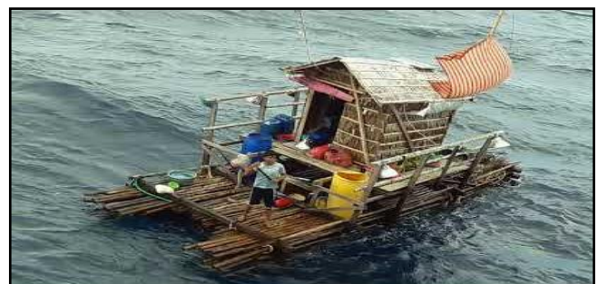
Figure 2. Rompong as a fishing tool that can float above sea level.

In the case below, a traditional fishing gear called Rompong or in Ambonese sero is bamboo and equipped with a house. The coast people of Ambon Island use this tool to catch fish. The critical question is why this traditional tool can float above sea level? The answers have been recorded as follows.