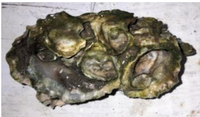
Figure 7. Crassostrea rhizophora

Crassostrea rhizophora or oysters generally live in colonies, attached to rocks or mangrove/mangrove roots. These oysters measure 3-7 cm, when in a colony the size can reach 25-30 cm. The shape of the shell of Crassostrea rhizophora is irregular on the sharp edge of the shell. The shell is made of limestone with a brownish or greenish purple color (Antonio, 2021). Although the size of this species fluctuates according to the environmental conditions in which it lives, it can reach a pretty considerable size. This clam is frequently found in muddy coastal locations because of its ability to stick to hard substrates, such as the roots of mangrove trees, thanks to a feature of its snout that is bent on one side of the shell. In coastal habitats, this species is significant. By purifying the air and giving other organisms a place to live, they support the health of the environment. The health of the aquatic environment can also be determined by this clam.