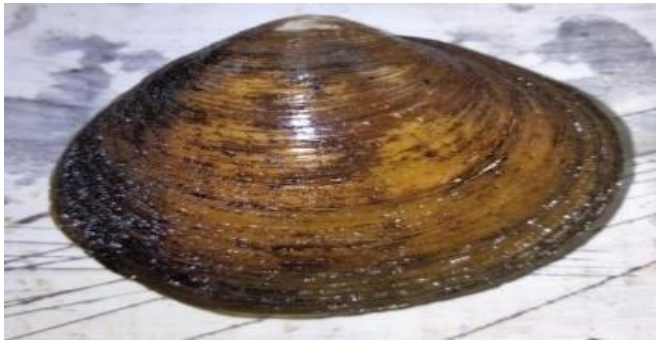
Figure 6. Polymesoda erosa

mangrove areas, therefore these clams are also called mangrove clams. According to (Widianingsih, 2020), the bivalvia Polymesoda erosa is exclusively taught in the lumpur dataran that enslaves Muara Zuari. Due to the importance of its nutrients, Polymesoda erosa consumption has steadily increased in Goa in recent years. In addition to protein, Polymesoda erosa typically contains vitamins, minerals, amino acids, and lemak that are palatable.