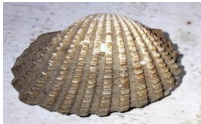
Figure 3. Anadara granosa

Anadara granosa or often called blood clams are a type of sea shell that has a very thick shell measuring 3-4 cm, has two shell pieces with a wide hinge, the color varies from white, brown and blackish brown with a serrated, grooved surface pattern (Nadaa, 2021). Anadara granosa lives by immersing itself in paired substrates. Anadara granosa is often referred to as blood cockles because of the reddish-brown color of Anadara meat. This color occurs because of the presence of hemoglobin in the blood. Anadara granosa lives in groups and is generally found in substrates that are rich in organic content (Mawardi, 2021).