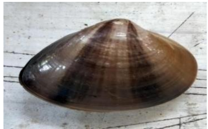
Figure 4. Megapitaria squalida

These species are important to the air quality system as filters that help maintain air quality by removing organic particles. Additionally, they provide food and habitat for several predators (Jiménez-Quiroz, 2021). Several studies on Megapitaria squalida have been conducted, including on habitat, reproduction, and diversity (López-Rocha, 2021); (Schweers, 2006).