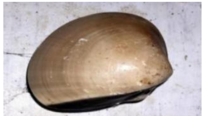
Figure 5. Meretrix lyrata

Associated with the bottom substrate of the waters, the tofu clam ( Meretrix lyrata ) is a type of estuarine clam that has experienced degradation in the waters of Kendari Bay (Duisan, 2021). The Meretrix lyrata shell is fan-shaped with a size of 4-6 cm, the surface texture of the shell is smooth and shiny. Meretrix lyrata is also called tofu clam, as the name suggests, this clam is white and has a black silhouette on one side of the shell (Lase, Spesies Kelas gastropoda dan Bivalvia di Muara Saragian Kabupaten Aceh Singkil, 2021). At first glance, Meretrix lyrata is similar to Megapitaria squalida , maybe some people think these two clams are the same type of clam. Meretrix lyrata lives in tidal habitats by burying itself in fine sandy substrates. Like other bivalves, Meretrix lyrata are filter feeders that feed on plankton and small organic particles dissolved in the water. They filter their food through gills that also function in gas exchange (Putri, 2021).