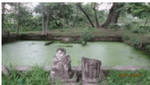
Figure 6. The Ngoro Den Panji Site

Beruk Mountain is a natural tourist destination that offers a beautiful panoramic view of the mountains from a height. The area is also equipped with various facilities, such as an arena for outbound activities, camping areas, and photo spots.