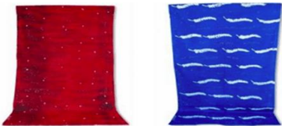
Figure 4. Batik Ciprat Product made by people with Tunagrahita

The last stage is technology-based marketing and sales training. In this stage, Rumah Harapan helps in terms of promotional tools. Regarding the continuation of the batik ciprat training for the tunagrahita community, it is held regularly every Wednesday at Rumah Harapan. To ensure they are able to produce quality products, the training is repeated. The duration of the training varies depending on the ability of each individual. Some are able to produce crafts within a week, while others take a month or even several months to be able to make products properly. Here is an example of the Batik Ciprat products produced.