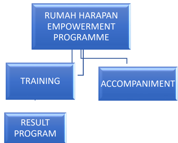
Figure 1. Stages of the Empowerment Programme

The empowerment initiatives implemented by Rumah Harapan are in line with the "Ladder of Citizen Participation" model proposed by Arnstein (1969). This model highlights the transition from passive participation to active involvement, which is seen in the transformation of the role of citizens in managing tourism activities.