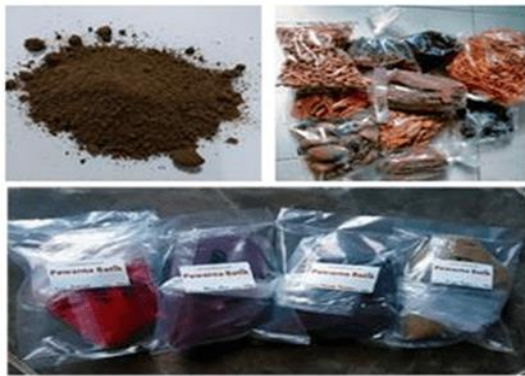
Figure 3. Ciprat Batik Natural Dye

The third stage was the training in making ciprat batik. At this stage, the tunagrahita batik makers were trained to make ciprat batik with new designs using modified brushes to create various motifs. For those with better communication and understanding skills, copper batik stamps and electric canting were also provided for use. The use of these new tools aims to produce ciprat batik products with higher value.