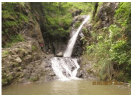
Figure 7. Dong Mimang Waterfall

The Ngoro Den Panji Site is a historical site in Karangpatihan Village that holds ancient statues from the Hindu-Buddhist period. This site is thought to be a relic of the Ancient Mataram Kingdom in the 10th century AD, precisely during the time of Mpu Sendok in East Java. Research on the Ngoro Den Panji Site was conducted by the Trowulan Antiquities Preservation Centre (BP3), which identified the historical significance of the site.