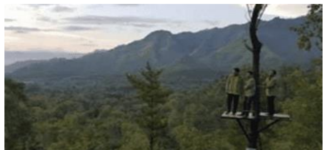
Figure 5. Beruk Mountain

The tourism aspect is considered capable of being one of the empowerment models that increase participation and self-confidence for Tunagrahita residents, this is in line with research by Shilfani et al. (2022), stating that the empowerment of tunagrahita residents based on tourism villages forces tunagrahita residents to interact with the general public and indirectly, this right is able to increase their self-confidence. This is also supported by research from Yusuf et al. (2022), which states, residents of tunagrahita will feel involved in participation in the social environment, when they are involved in aspects of village promotion through tourist villages.